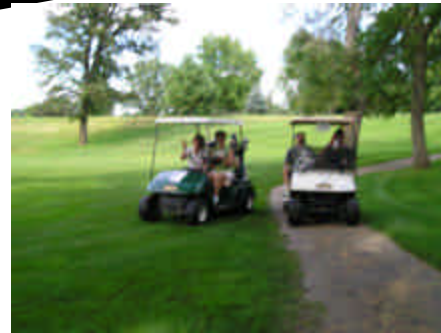
Cruisin' around Oneota

We've got a new feature for the Client Update! You've been used to reading about Midwest Group Benefits' employees in this space. Over the past two years you've 'met' them all. As new employees are hired, they will be profiled in this space. This month we're starting a new feature—our Agent / Agency Spotlight. We work with several great agents and agencies, and would like you to have the opportunity to get to know them.